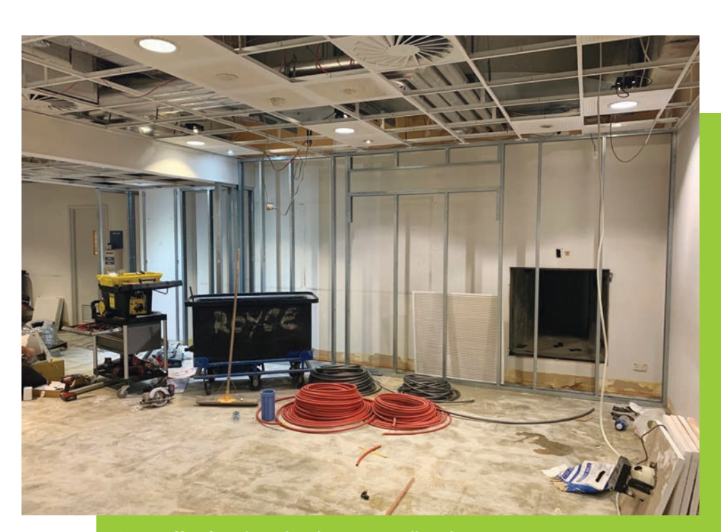
Our staff cafeteria redevelopment well underway!

Thanks to his generosity, this newly developed area will be appreciated by many people for years to come.