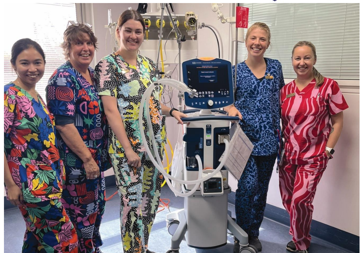
Fun scrub Fridays