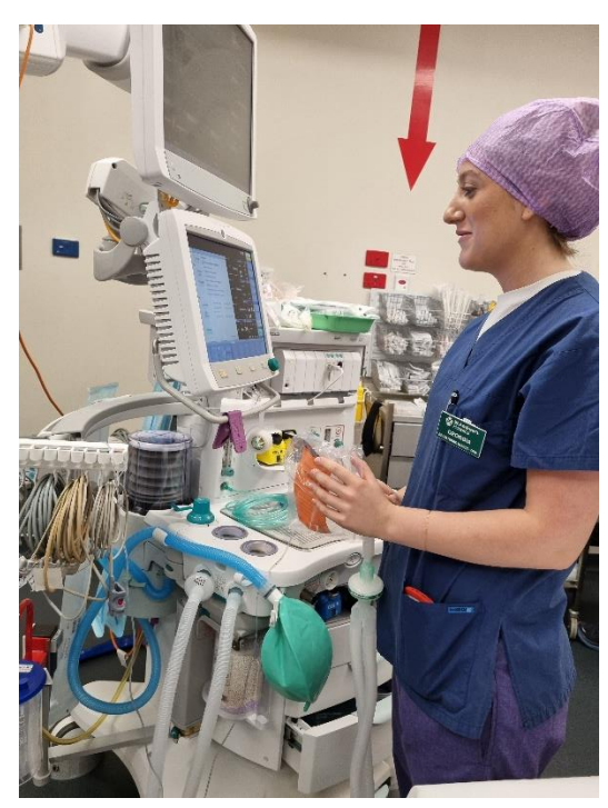
One of our Perioperative Graduate Nurses, 2024