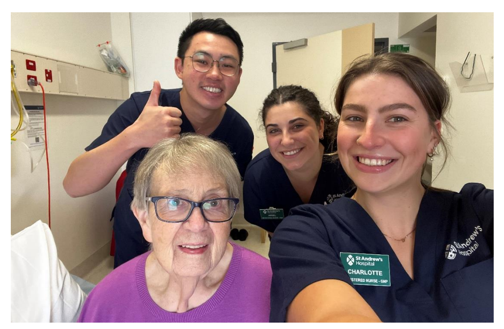
Graduate Nurses and a Patient on 'What Matters to You?' Day 2024