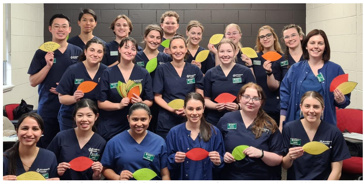
Ward and Procedural Suite Graduate Nurses on 'What Matters to You? Day' 2024