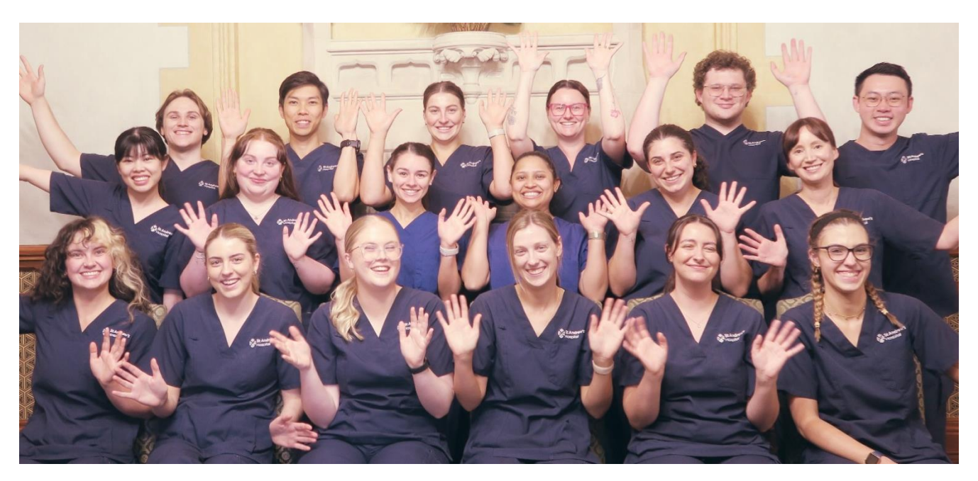
2024 Ward Graduate Nurses