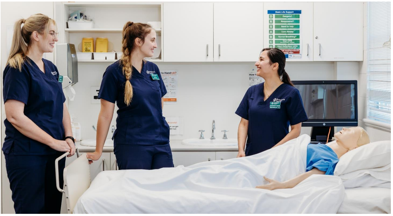
Graduate Nurses 2023